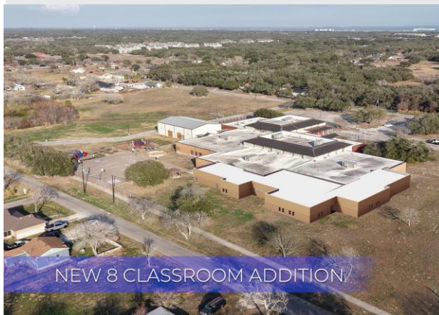
NEW 8 CLASSROOM ADDITION