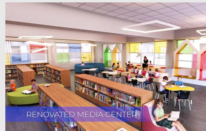
RENOVATED MEDIA CENTER