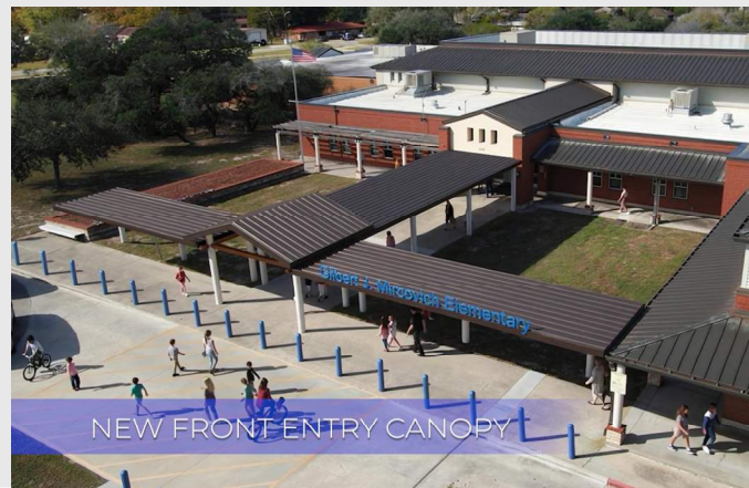
NEW FRONT ENTRY CANOPY