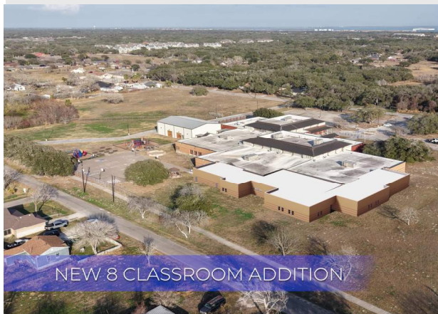
NEW 8 CLASSROOM ADDITION